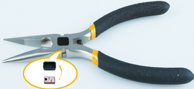
Protective Cover (avoid damage during the tool using process)

Visit www.junmp.com.cn to learn more about the complete line of Junmp RFID products.